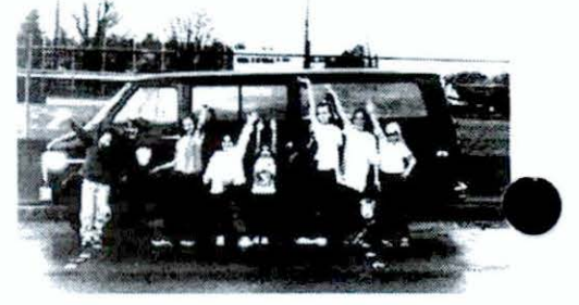
Children pose with the Park and Recreation Department's new addition.