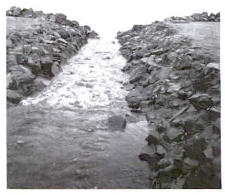
McSorley Creek empties into Puget Sound at Saltwater State Park.

The main stem of McSorley Creek is 2.0 miles long and originates at a very large 150-175 acre wetland located (within the City of Kent) on the east side of Pacific Highway South between South 260th Street and South 272nd Street. The wetland receives a substantial amount of surface water from the Star Lake Road area, located in the City of Federal Way. From the wetland, the stream flows westward and passes through a culvert below Pacific Highway South and then through a second culvert at South 260th Street. The stream then flows northwest unimpeded through a deep ravine and below the south twin bridge at 16th Avenue South to where it joins with