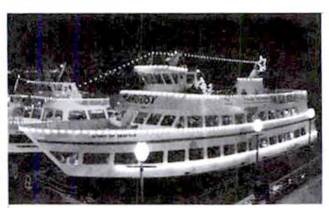
Moines Beach Park and Redondo Dec. 5.

The annual bonfire will be held at the Des Moines Beach Park on Sunday, Dec. 5 from 5-6 p.m. Join holiday-spirited folk and enjoy complimentary cookies, hot cider, and hot cocoa. The Argosy Christmas Ship will anchor off shore in front of the Des Moines Beach Park for the Bellevue Chamber Chorus to perform traditional holiday songs from 5:10-5:40 p.m., and then depart for Redondo where the chorus will perform again The Argosy Christmas Ship visits Des from 6:25-6:55 p.m.